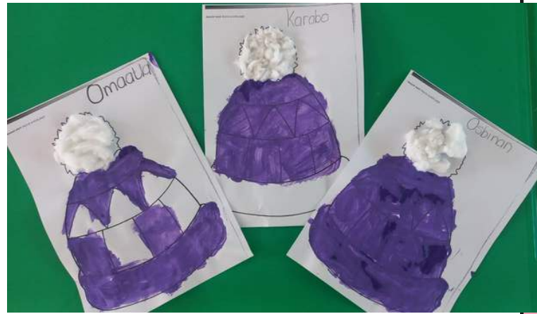
Left: Omaatla Pencil (RT)